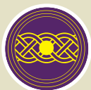
CHALLENGE Complete challenge