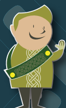
FIONN THE LEADER