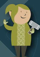
SINEAD THE MAKER