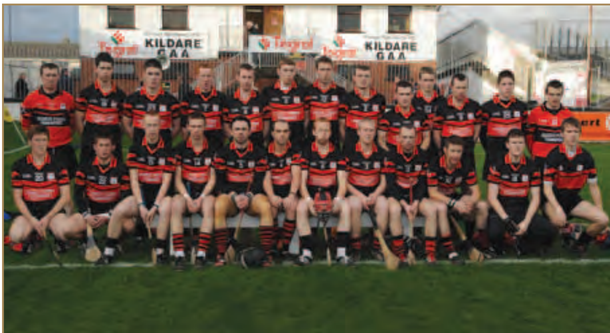
Mt. Leinster Rangers Leinster Intermediate Club Hurling Champions 2011 who went to claim All Ireland glory