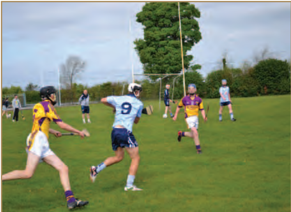
Young Dublin and Wexford hurlers meet at a Hurling Academy Squad Blitz

In 2011 Leinster GAA also delivered foundation courses in Froebel College of Education, Marino Institute of Education as well as workshops in the Church of Ireland College of Education and St. Nicholas, Montessori, Blackrock.