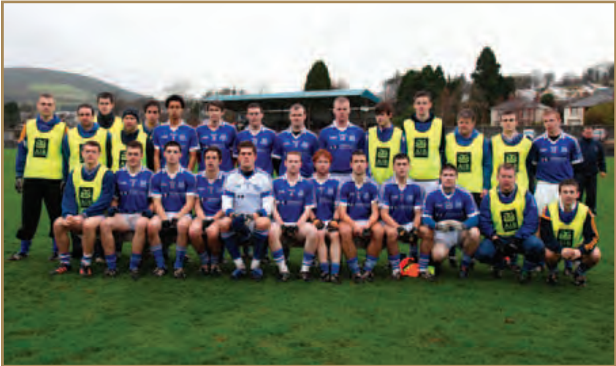
Éire Óg (Wicklow) - Leinster Club Intermediate Football Champions 2011