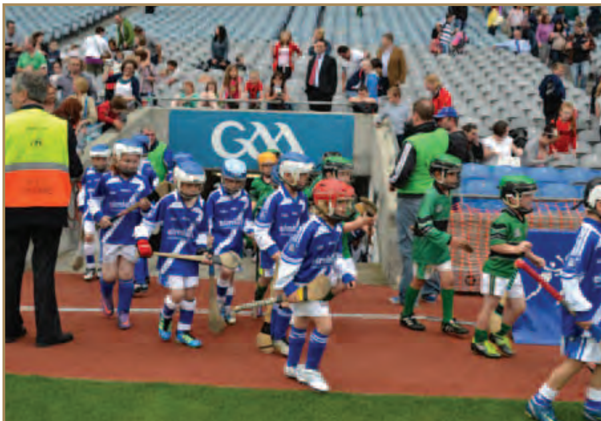
Young hurlers ready for action on their Croke Park Activity Day

For games development to truly have an impact it must be given greater recognition and a stronger platform alongside other committees. With such a commitment, together they can provide the coaching, the games and activities necessary to increase participation and standards in a coordinated manner. Without such structures in place the return on our investment is open to question.