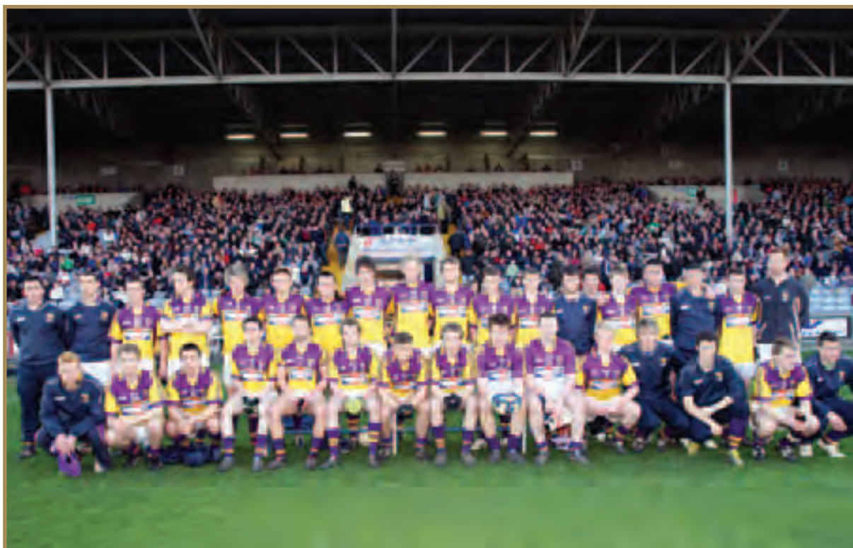
Wexford - Leinster U-21 Football Champions 2011

In tandem with reviewing our fixture schedule in Leinster I feel it would be appropriate, also, to