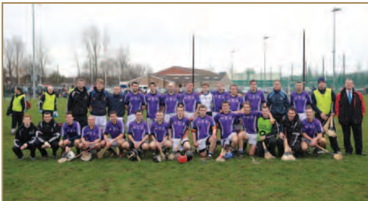
Fingal - Bord na Móna Kehoe Shield winners 2012