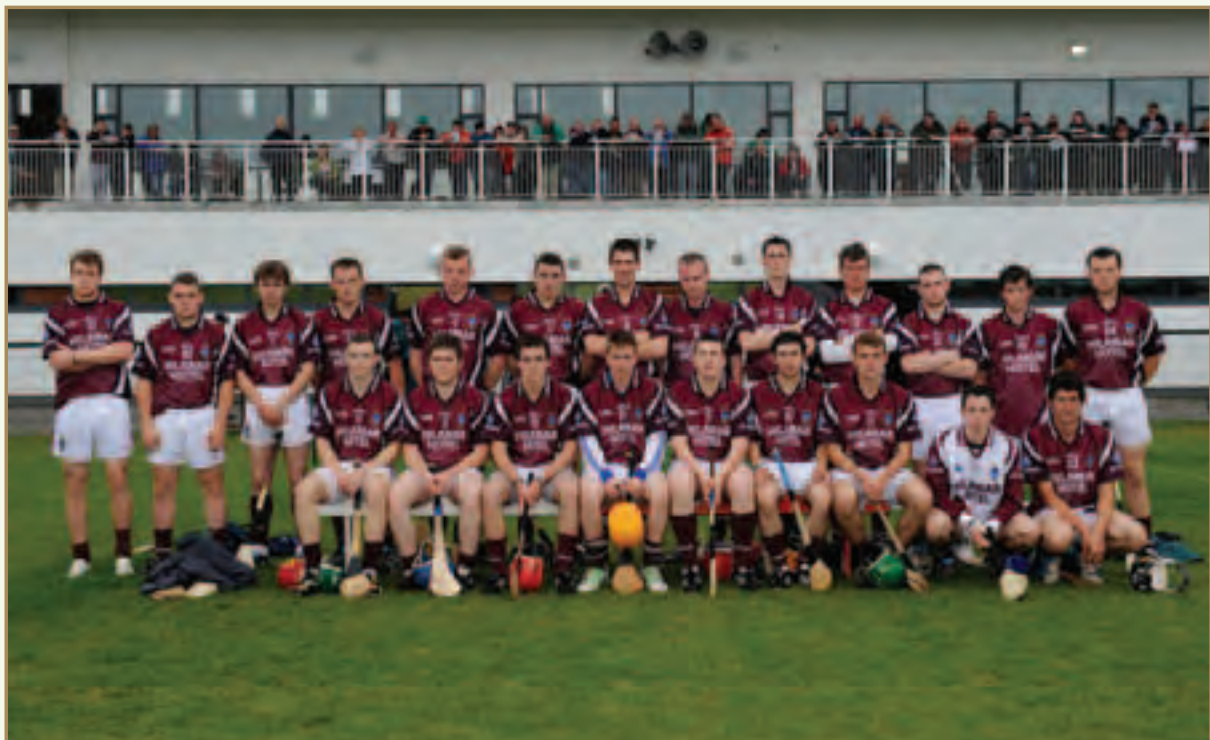
Westmeath - Leinster Under-21 'A' Hurling Champions 2011