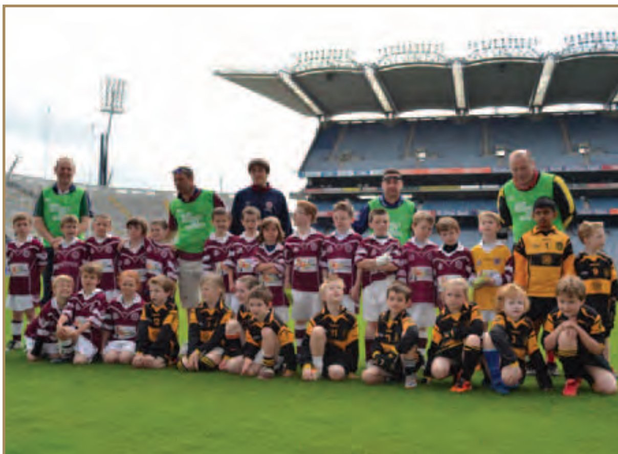
Opposing teams pose for a photo before facing off at Croke Park during an Activity Day

A special mention needs to go to those who made both days such a success. To run such an event requires assistance from many people, Our sincere thanks to the Volunteer Stewards in Croke Park, Full Time and volunteer Staff from Leinster GAA, Croke Park Staff and in particular to the students from IT Carlow who are currently doing the BA in Sport & Exercise (GAA). One other group key to the smooth running of the day was the Young Whistlers from Dublin and Laois who performed excellently over the 2 days.